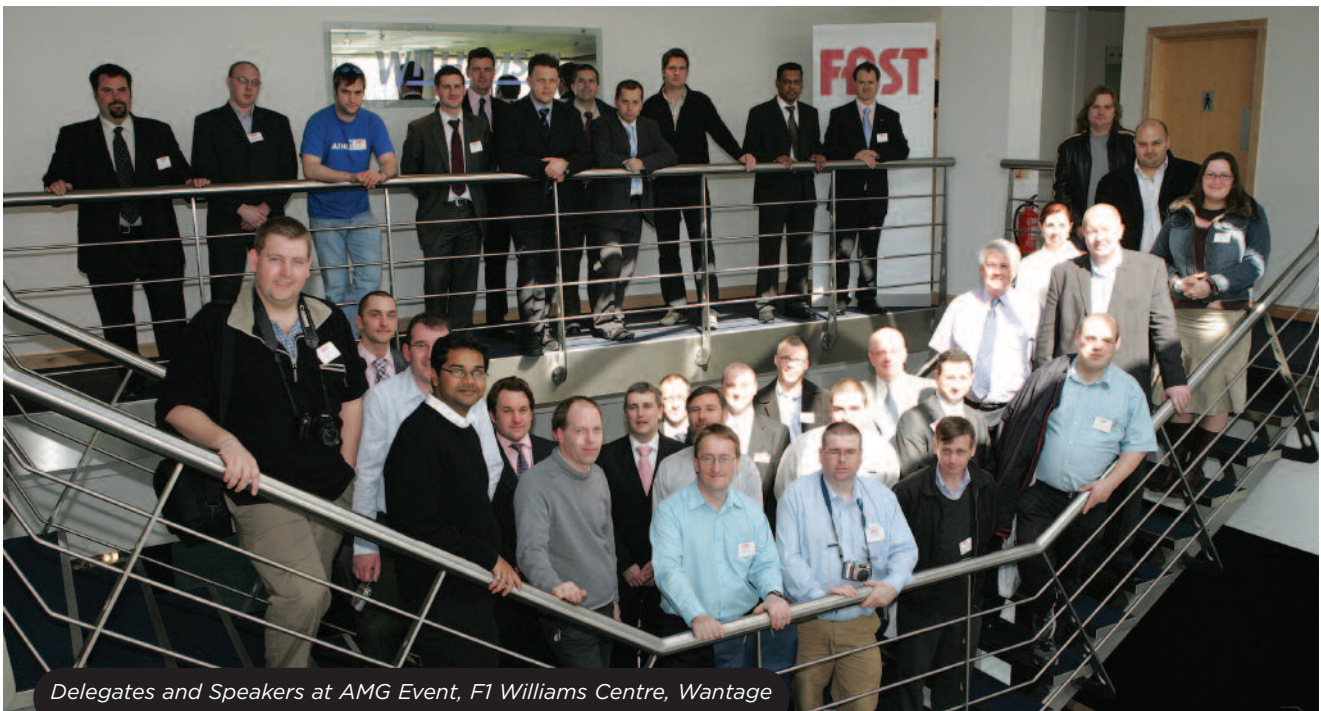
Delegates and Speakers at AMG Event, F1 Williams Centre, Wantage

We look to harness the knowledge of our member base to provide "Thought Leadership" on emerging technologies and issues. In the programme for 2008 we will be looking at the impact of virtualisation on software licensing and asset management practices. Current plans include a one day event exploring the issues, and the publication of a user guide. We will also be looking at software as a service, and plan an event which will include a debate on the implications for a company's business model of moving to this service approach, as well as the technical delivery options.